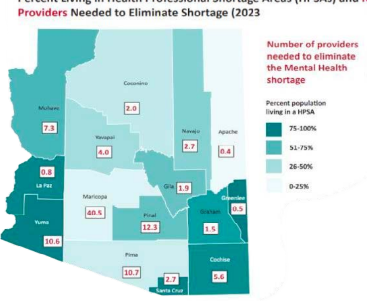
Percent Living in Health Professional Shortage Areas (HPSAs) and Number of Mental Health Providers Needed to Eliminate Shortage (2023

In Arizona, according to the Substance Abuse and Mental Health Services Administration (SAMHSA), an estimated 21.8% of people older than 18 years old experienced any mental illness in the prior year.<sup>2</sup> While multiple physician specialties, health care professionals like nurse practitioners and physician assistants, and behavioral health professionals like counselors can provide different types of mental health services, the mental health, Health Professional Shortage Areas (HPSAs) in Arizona are based on a ratio of psychiatrist physicians to population. According to the Health Resources and Services Administration, Arizona needs between 142 and 223 psychiatrist physician full-time equivalent (FTE) to eliminate the current mental health care shortage.<sup>3</sup> Of the fifty states and the District of Columbia, Arizona ranks 35th in psychiatrist physicians per population.<sup>4</sup>